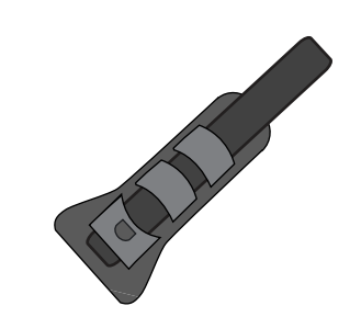
Step 7. Insert pole into bracket.

Note: Remember to take flag down at sunset and do not fly flag in rain or snow.