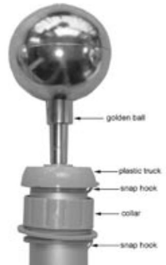
a. Screw the golden ball into the plastic truck